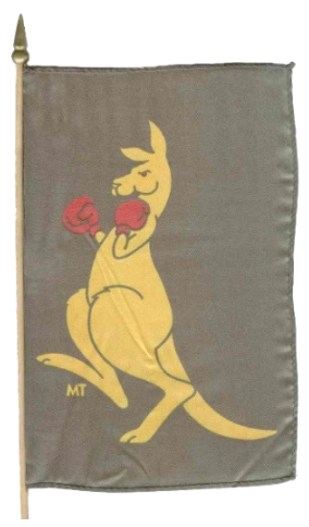
Fig. 9 ca June 1984

Initially in November 1983, licences to produce "legal" Boxing Kangaroo Flags were granted to two flag manufactures, Pennant House in Perth, who was given the sole selling rights for Western Australia, and to Evan Evans Flags in Melbourne, for the rest of Australia and all territories controlled by Australia.<sup>3</sup> Evan Evans Flags were replaced by Carroll & Richardson Flags, also of Melbourne, in February 1985. Examples of licenced approved Boxing Kangaroo Flags: