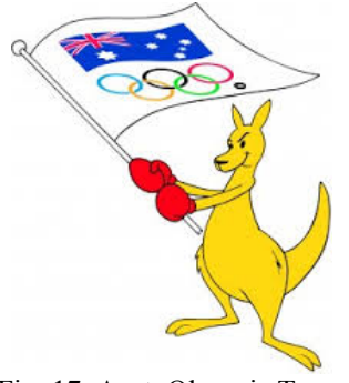
Fig. 17 Aust. Olympic Team – Seoul 1988

The Boxing Kangaroo design was also incorporated into the designs used by the Australia's Commonwealth Games and Olympic Games' team emblems.