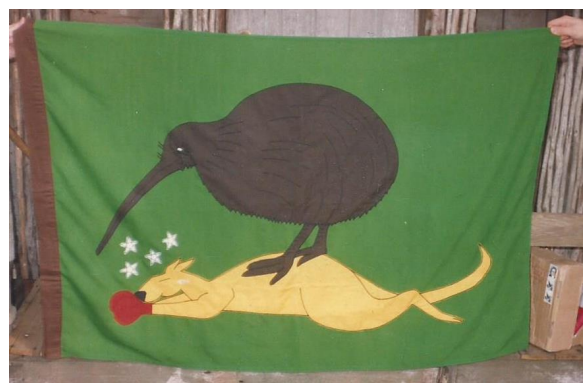
Fig. 31 "Triumphant Kiwi Flag" - c.1987-88

The result was a pleased looking Kiwi standing on top of a knock-out and / or dazed Boxing Kangaroo, with stars above its head. Even though New Zealand's then supremacy over Australia in Cricket was only short-lived, this one-off "Triumphant Kiwi" flag has been displayed on both sides of the Tasman Sea, at ICV 13 in Melbourne - Sept. 1989, and on various occasions in Auckland, Dean Thomas' then home city. 12