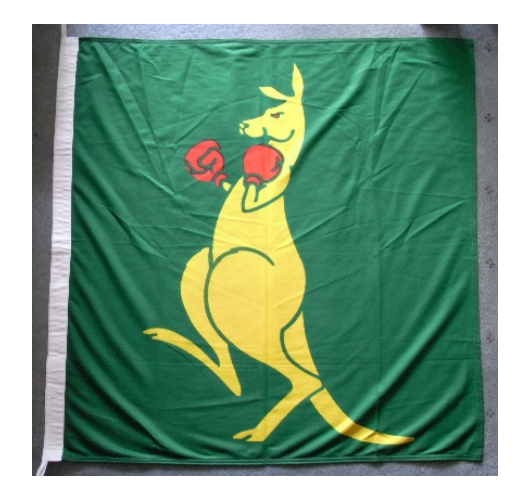
Fig 11 Carroll & Richardson Flags (1985-87)