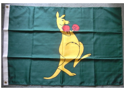
Fig. 22 A J Flags – Peakhurst, NSW – 2000s

While I have not definitely been able to find out why this change was necessary, I suspect that it was to distinguish future sales of the Boxing Kangaroo Flag from the previous licensee, thus preserving a hopefully steady flow of income to the AOC. Together with the change of ownership there was a change of official flag manufacturer for the Boxing Kangaroo Flag. The licence to produce this flag was then given to AJ Flags of Peakhurst, NSW, who imported a printed version of this flag from Taiwan, but for some time now the production licence for this flag has been returned to Evan Evans Flags in Melbourne, Victoria.<sup>9</sup>