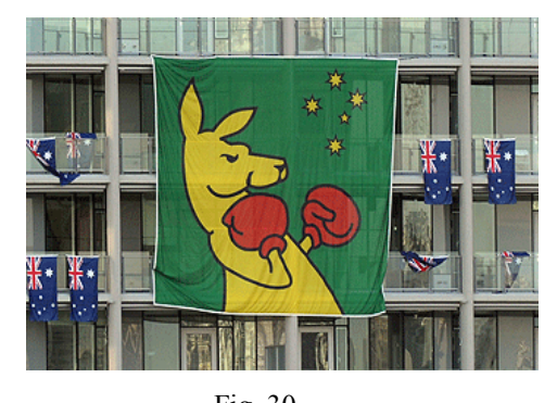
Fig. 30 Winter Olympics – Vancouver 2010

Olympic Committee (IOC) official complained about the flag because it was a registered trademark and regarded it as too commercial, contrary to the ban on marketing displays at Olympic venues. The then Australian Deputy Prime Minister, Julia Gillard described calls to remove the flag as "ridiculous". The Australian Olympic Committee (AOC) explained that the Boxing Kangaroo had been a team mascot since the Sydney Olympics, and it was not selling any boxing kangaroo merchandise in Vancouver. The IOC was persuaded to agree to the banner remaining, and the AOC undertook to register the design with the IOC as an official team identifier. The banner remained attached to the balconies for the duration of the Winter Olympics.<sup>10</sup>