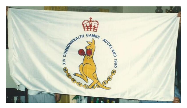
Fig. 18 Aust. Team Flag – Auckland, NZ 1990

Following Alan Bond being declared bankrupt in April 1992,<sup>6</sup> and the collapse of his Bond Corporation, formal rights / ownership of the Boxing Kangaroo symbol and flag, together with all other related merchandise, were sold to the Australian Olympic Committee ("AOC") in 1993 for approximately $100,000.<sup>7</sup> With the change of ownership the Boxing Kangaroo logo and flag was given a full " Queer Eye for the Straight Guy " style makeover, giving it a more "metrosexual" gender neutral appearance.<sup>8</sup> This new version of the Boxing Kangaroo, now referred as "BK", was unveiled by the AOC in July 2004 as their official mascot, replacing Willy the Koala , which had been the AOC's mascot since 1984. From a vexillological perspective, the greatest change was in the direction of the Boxing Kangaroo on the flag. Originally the design faced the hoist; now it faces the fly. Moreover, in the lower fly corner of the flag there now appear the following, "©® AOC", so that this is an officially licenced version Boxing Kangaroo Flag.