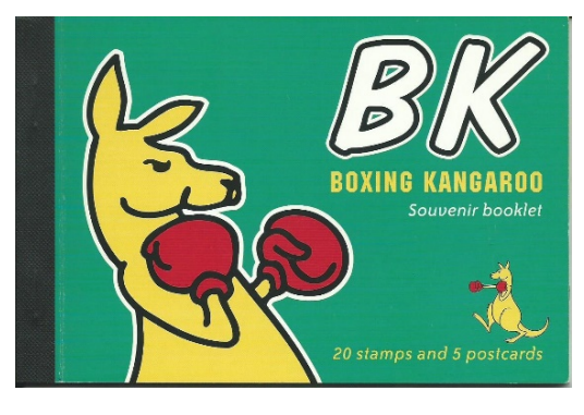
Fig. 21 "Metrosexual BK" Boxing Kangaroo