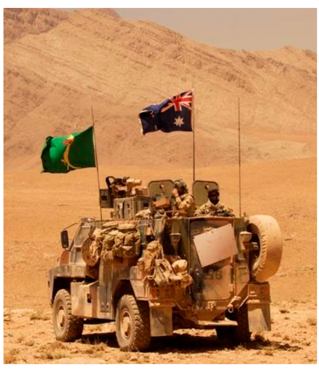
Fig. 38 Afghanistan c.2000s Australian Army "Bushmaster"

On 17 September 2014, the Australian commercial television programme "Sunrise" held a mini-debate about which flag is more popular, the Australian National Flag or the Boxing Kangaroo Flag. At the end of the debate they displayed a combined flag replacing the British Union canton with the Boxing Kangaroo Flag as the canton.