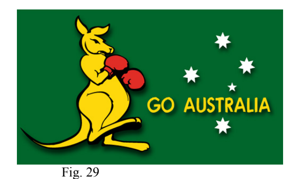
The Flag Shop – Vancouver