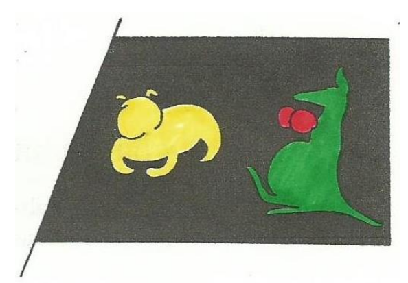
Fig. 36 "Apollo V" Battle Flag – Aug. 1981 ^{\rm 16}