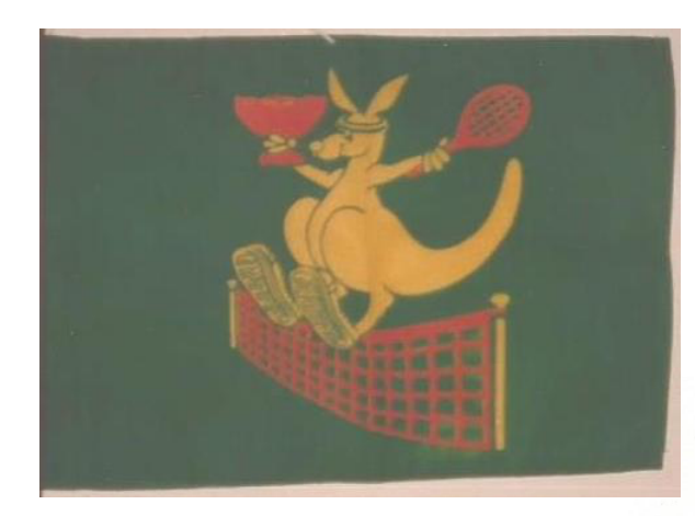
Fig. 12 Test Cricket – late 1983